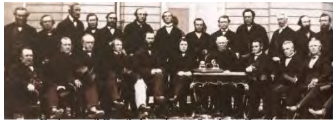
Fathers of Confederation - Quebec Conference

One hundred and fifty years ago in Charlottetown and Québec City, the Fathers of Confederation first dreamed of a united and prosperous Canada.